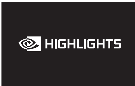
Preferred Button on Black Background