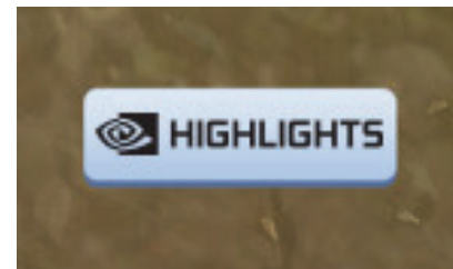
Button Example in FORTNITE